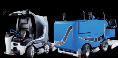
Mobile / Event

Outdooricerinks.com Strongsville (OH) Phone 1-440-628-7979 www.outdooricerinks.com