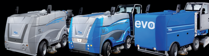
Pro / Heavy duty